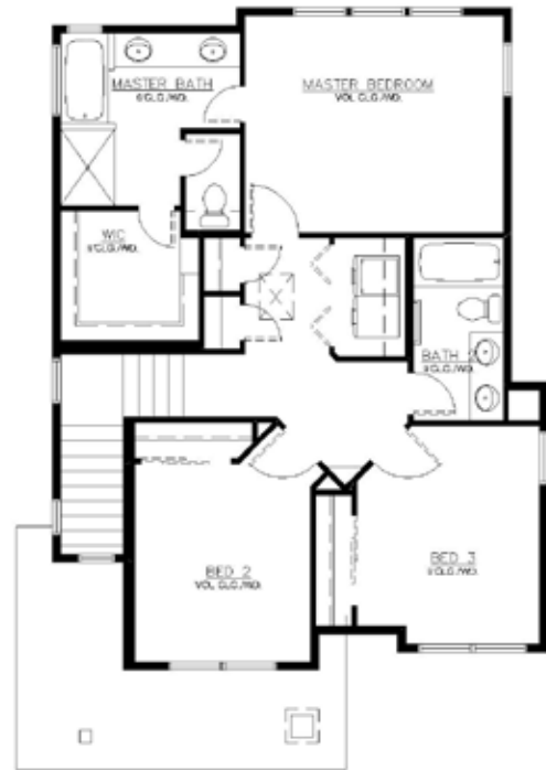
UPPER LEVEL 918 finished sq ft