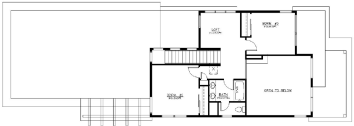
UPPER LEVEL 631 finished sq ft