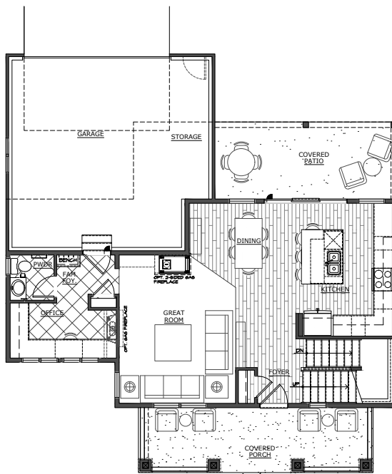
MAIN LEVEL 816 sq ft